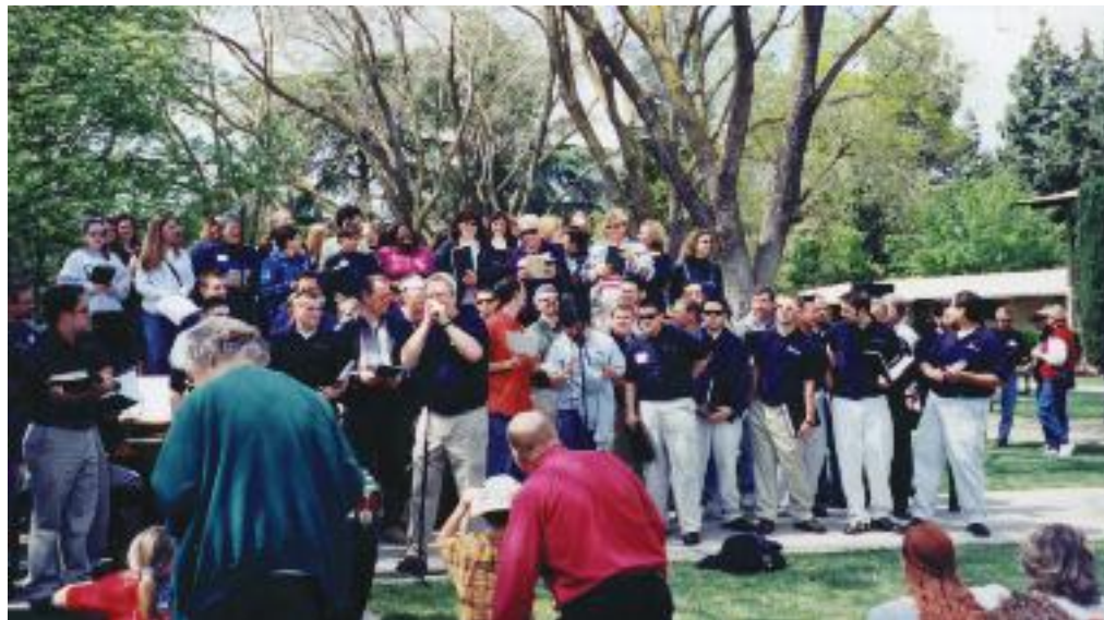
MCC SALE DRAWS THOUSANDS TO FPU —The annual Mennonite Central Committee (MCC) Relief Sale attracted alumni, students and others from throughout the Valley to campus April 4-5 and grossed $255,000 to help people around the world.