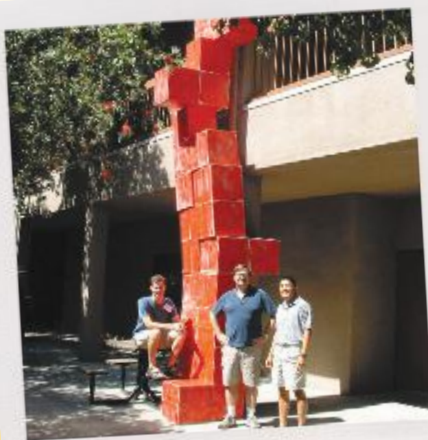
Building skills together