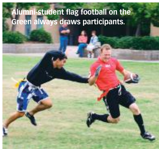
Alumni-student flag football on the Green always draws participants.

That was the theme of the 2005 Homecoming celebration October 12-15. New and renovated facilities, new programs and a new academic structure were among the changes commemorated. Events included reunions for the classes of 1955, 1965, 1975 and 1995, as well as young alumni as a group. Alumni-student sports contests covered powder puff football, men’s flag football and women’s basketball, while alumni men played soccer against California State University, Fresno. On the intercollegiate side, the men’s and women’s soccer teams defeated San Diego Christian and women’s volleyball scored a victory over Vanguard. The Battle of the Bands and Candlelight Concert provided musical entertainment.